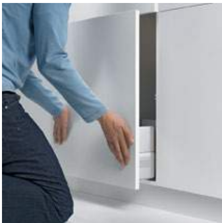
4. Insert and close pull-out – this automatically sets the correct depth position