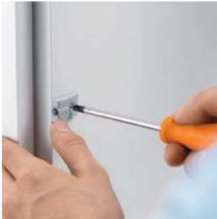
1. Install Blum spacing bumpers

SERVO-DRIVE uno can be installed quickly and easily.