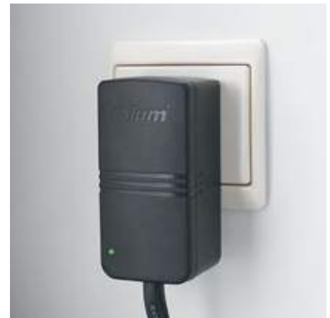
6. Connect SERVO-DRIVE uno to power outlet