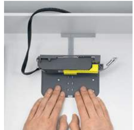
3. Slide on SERVO-DRIVE unit