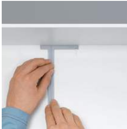
2. Position assembly device on the cabinet base