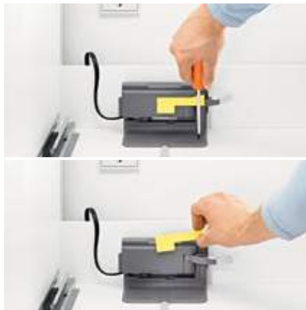
5. Screw on SERVO-DRIVE unit, remove transport protection